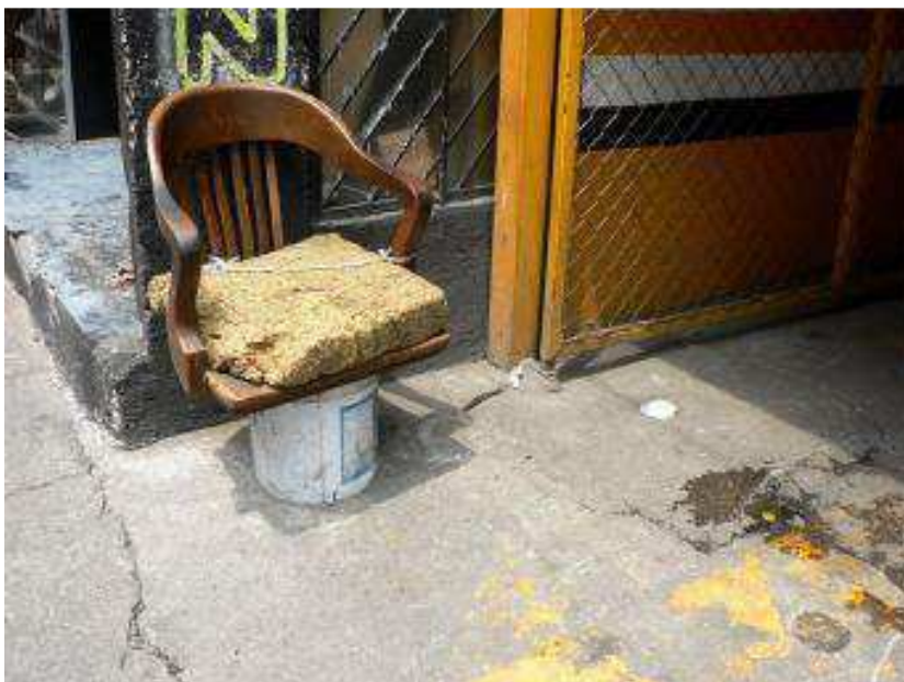
Figure 1 Cao Guimarães Gambiarras # 50 , 2011. http://www.portugues.rfi.fr/sites/portugues.filesrfi/imagecache/rfi_43_large/sites/images.rfi.fr/files/aef_image/gambiarra_s_big.jpg

“Gambiarras” are, first and foremost, moments of lucidity, yet of an oblique kind. Maybe this is the reason why Brazilian artist Cao Guimarães (Belo Horizonte, 1965), has become a “gambiarra hunter;” since 2002, when he started this photographic series. This photographer and filmmaker defines the term “gambiarra,” from Brazilian slang, as a mode “to solve problems by alternative means or granting different functions to different objects” (interview quoted in Grossi 2011). Argentinean psychoanalyst, Lucia Grossi, expands the definition, adding that gambiarras are quick fixings—an expression of a home-made taste that emphasizes a temporary condition, which ends up becoming permanent (2011). It is a Brazilian popular expression that loosely translates as “to make do” and “describe more generally the act of day-to-day improvisation” (Asbury 2008). Rodrigo Moura has emphasized the obscure etymology of the word, which has “gâmbia” (leg) integrated in its meaning, evoking the function of a crutch or provisional prosthetic with which balance is restored (Roesler 2013:6).